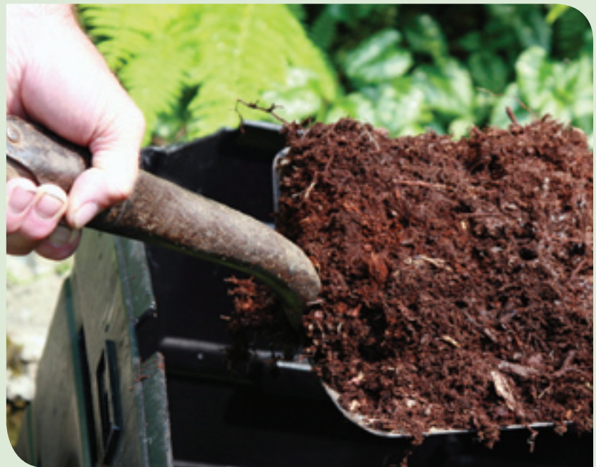
Turning garden and kitchen waste into compost reduces heat-trapping methane emissions from landfills, improves your garden’s soil, and helps it store carbon.

To read more about the science of composting and tips for choosing a system appropriate for your yard, visit the University of Illinois Extension website ( http://web.extension.illinois.edu/homecompost/intro.html ).